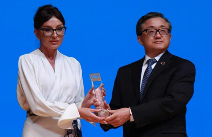
Mr. Liu Zhenmin, Under-Secretary-General for Economic and Social Affairs launched the 2021 United Nations Public Service Awards. The Awards, supported by UN DESA in collaboration with the United Nations Entity for Gender Equality and the

Empowerment of Women (UN Women), are an international recognition of excellence in public service.