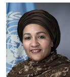
Featuring Deputy-Secretary-General Amina J. Mohammed